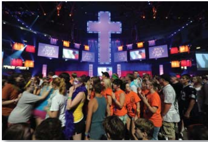
The 2012 theme is Citizens with the Saints, from Ephesians 2:14-20.

The Saint Paul Area Synod currently has 264 registrants from 16 congregations. There is still space to register. Registration will be open until 37,000 are registered. Registration now stands at 31,000. You still have time to join this journey, but you want to get on board soon. I encourage you to prayerfully consider this opportunity for the young people of your congregation.