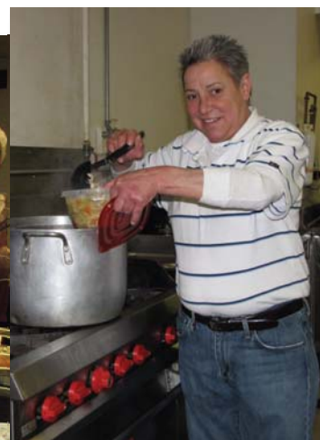
Each week, Bethlehem in the Midway packs up meals to take to those in the neighborhood who are homebound.