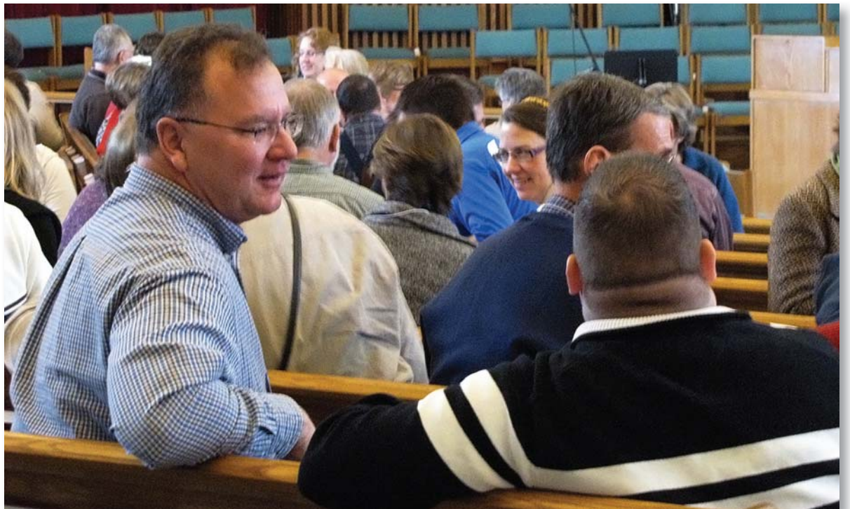
Lay leaders in discussion at 2011 Tool Kit for Congregational Leaders.

Tool Kit is typically held on a Saturday toward the end of February. This year, it will be February 25. Brochures are mailed to lead pastors, council presidents, and treasurers in each congregation in early January